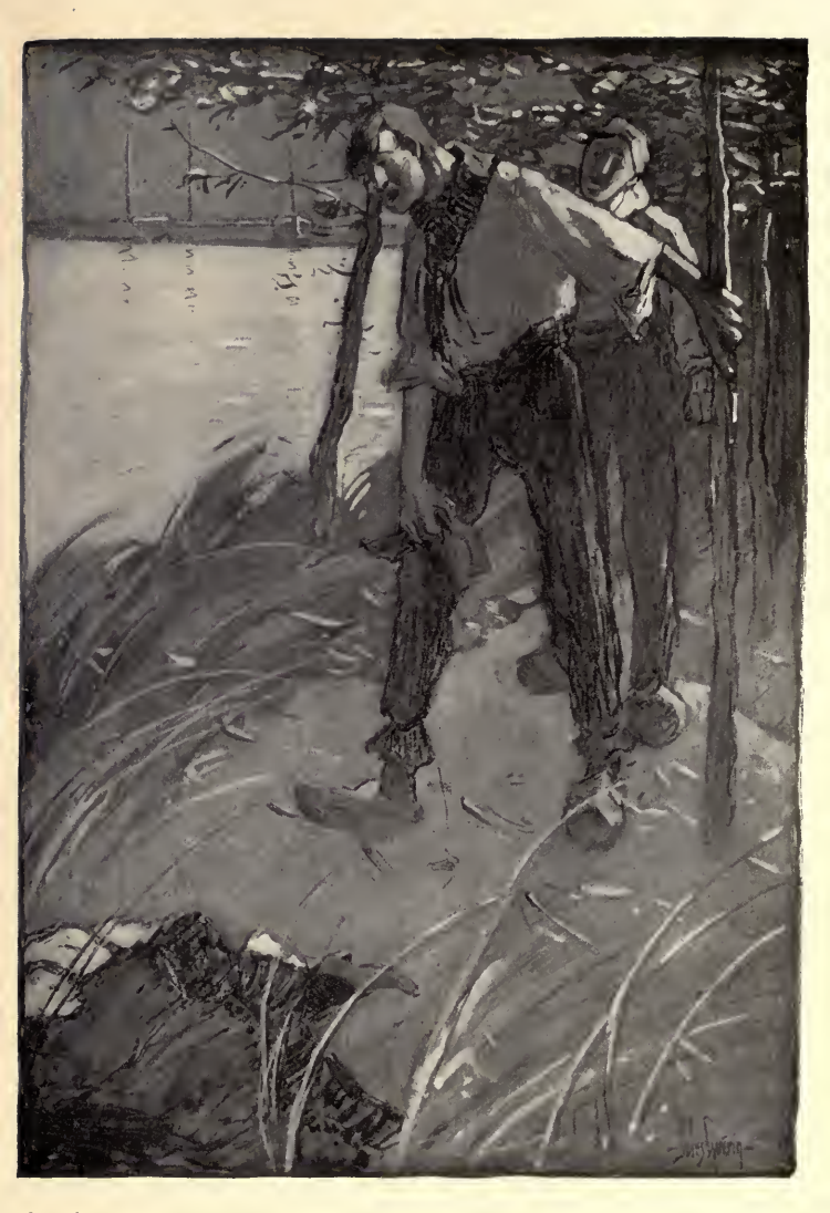
On the bank of the river, among the stumps and flags, was stretched the body of a woman.—Page 2.